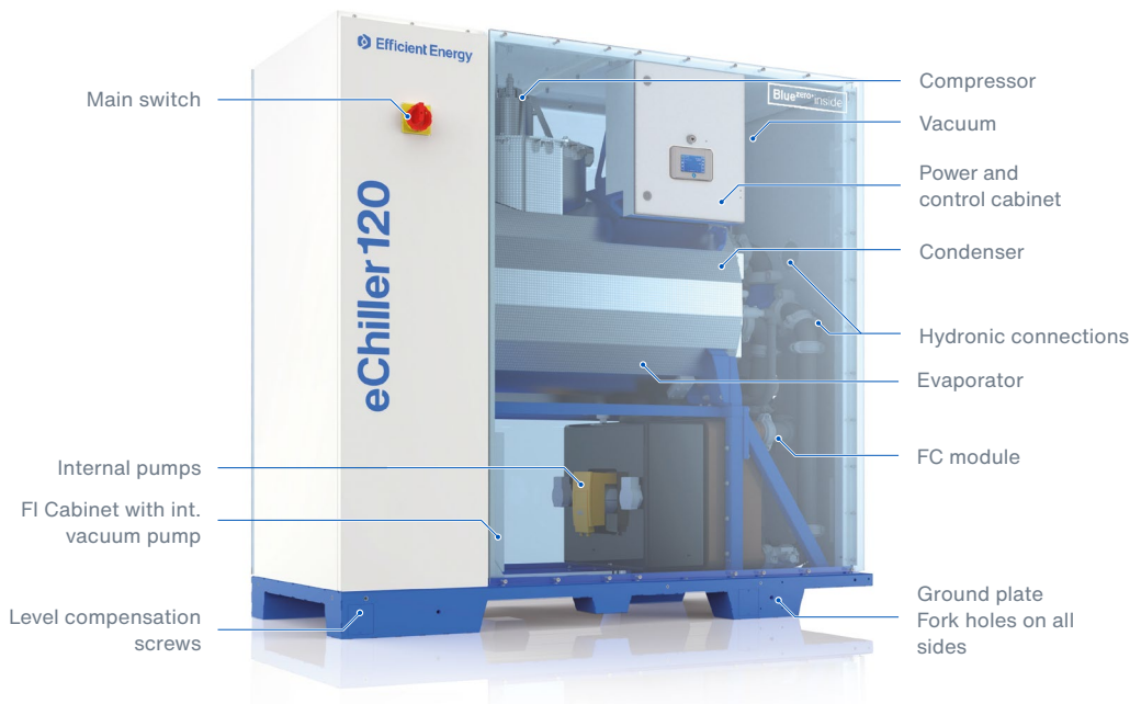
Illustration incl. all options